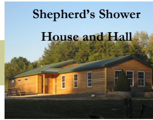
Shepherd's Shower House and Hall